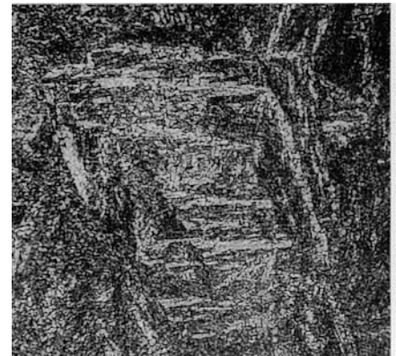
基体 Matrix 500X